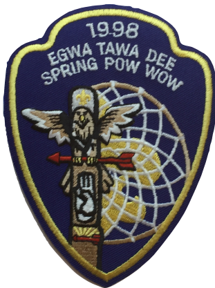
Table rental form and update information available at the OA Lodge website: www.aacegwa.org

Visit the Egwa Tawa Dee Lodge Trading Post to see new 2020 items. The nation's largest Scout Shop will be open across the hall on Saturday. Boy Scouts can work on Collections Merit Badge and meet requirement 3-C and other requirements at this event.