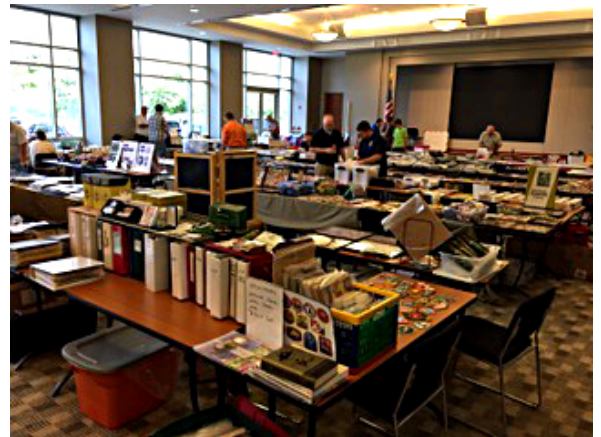
Table rental form and update information available at the OA Lodge website:

4,000 Sq. Ft. with 80 Tables Good Lighting, ADA Accessible FREE to visit, buy, trade